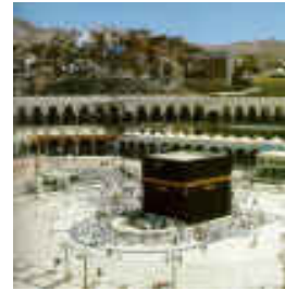
Tawaf (Circumambulation) of the Holy Ka'ba in Mecca, Saudi Arabia.

Dear Readers, We'd like to hear from you. Your comments and submissions may be featured in our upcoming Reader's Forum. This newsletter is also available online at : www.whymuhammad.com Thanks for your readership and participation!